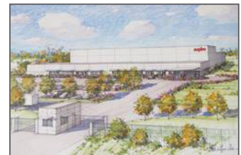
SANYO Solar of Oregon (SSO) Salem, OR New Wafer Factory Production starts October 2009