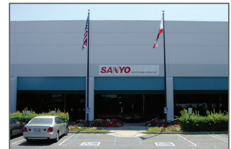
SANYO Solar USA (SSU) Carson, CA Wafer Factory