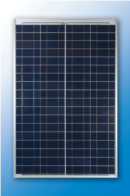
The SunWize SW-S85P solar module

The SunWize SW-S85P solar module delivers top-quality performance for all photovoltaic applications including telemetry, communications, security, rural electrification, water pumping and general battery charging. The SW-S85P can be used in single-module and multiple-module installations. Each module consists of two 36-cell series strings providing sufficient voltage for battery charging under extreme high temperatures. The modules are manufactured according to the strict requirements of international and US quality standards. Warranty: 5 -Year Limited Warranty of materials and workmanship; 20 -Years Limited Warranty of 80% minimum power output.