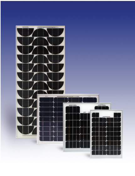
SunWize OEM Series 40W, 30W, 20W and 10W (l to r)

SunWize OEM modules deliver top-quality performance for all photovoltaic applications including rural electrification, water pumping, telemetry, communications, and general battery charging. Ideal for AC and DC installations, SunWize OEM modules can be used in single module and multiple-module systems. OEM10 and OEM20 modules have 34 solar cells and the OEM30 and OEM40 have 36 solar cells connected in series providing maximum charging power. The glass surface is impact resistant and allows maximum light transmission. Single crystalline solar cells are encapsulated and bonded to the glass in multiple layers of ethylene vinyl acetate (EVA) and laminated with a white Tedlar™ backing insuring long life in severe environmental conditions. Bypass diodes contained within the junction box insure reliable operation. Anodized extruded aluminum frames add strength and durability to the modules. Includes pre-drilled mounting holes. Weather proof junction box has multiple 1/2" knock-outs to accommodate liquid tight fittings and conduit or cable. OEM series modules are ISPR certified to IEC 61215 standards and are FM approved for Class I, Div. II hazardous locations. OEM series modules carry a 20-year, 80% power output warranty.